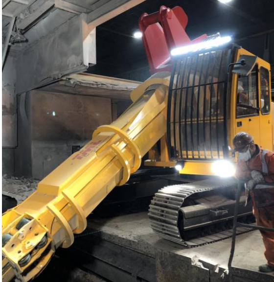
Unidachs 535 - Electric furnace outbreak