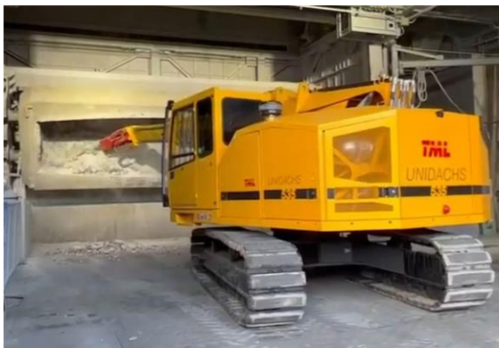
Unidachs 535 - Tundish cleaning